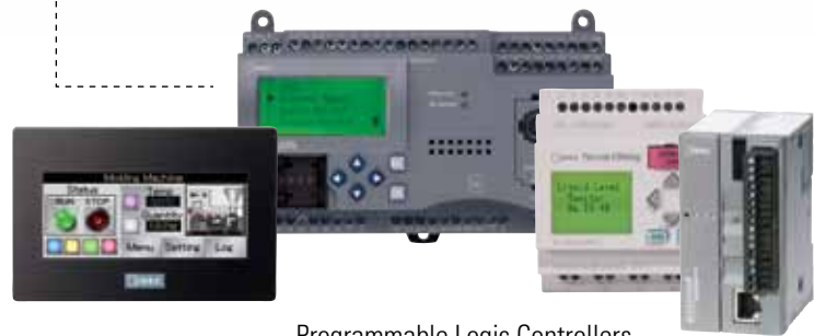
Programmable Logic Controllers